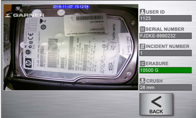
Proof of erasure image