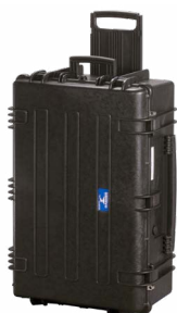
CASE-2XIC MIL SPEC shipping case